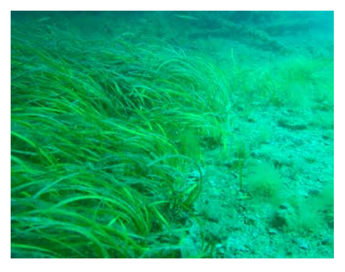
Some organisms, such as seagrasses, might reap positive effects as a result of increased ocean acidity, at least in the short term.

Environmental impacts of a leak will be most pronounced in the sediments and seawater in the immediate vicinity, and will decline with distance away from the emission point as the acidic seawater is diluted by normal pH seawater. Where distinct plumes of CO_2 are pulled away from the leak source by currents, effects may also be felt within the 'shadow' of the plumes. Modelling studies can take data from experiments and natural analogues and combine it with knowledge of local seawater chemistry and oceanographic conditions in order to enhance our understanding of how such CO_2 plumes might move and disperse, and what impact they might have on marine organisms.